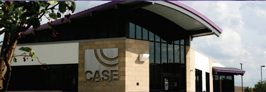
CASE Credit Union, West Saginaw Branch